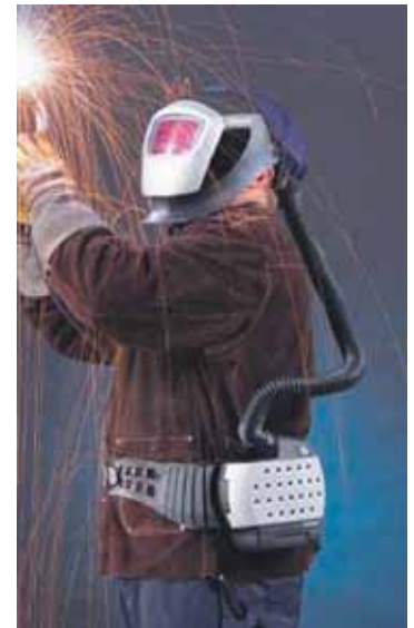
3M Speedglas™ AdFlo PAPR System Clean Air Welding System