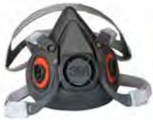
3M Half Face Piece 6000 Series