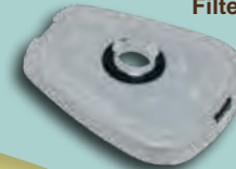
Filter Retainer • Use on top of cartridges