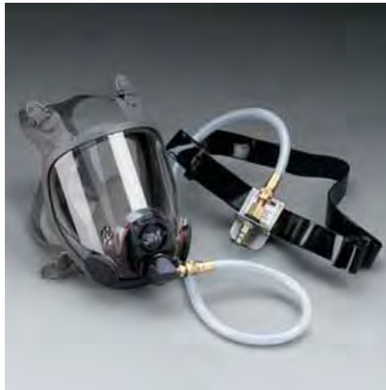
3M Dual Airline, Supplied Air, Tight-Fitting Face Piece Systems