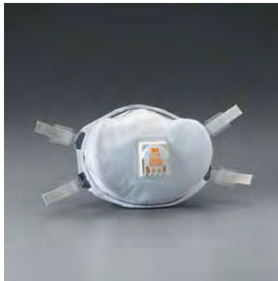
3M 8233 N100 Filtering Face Piece Respirator