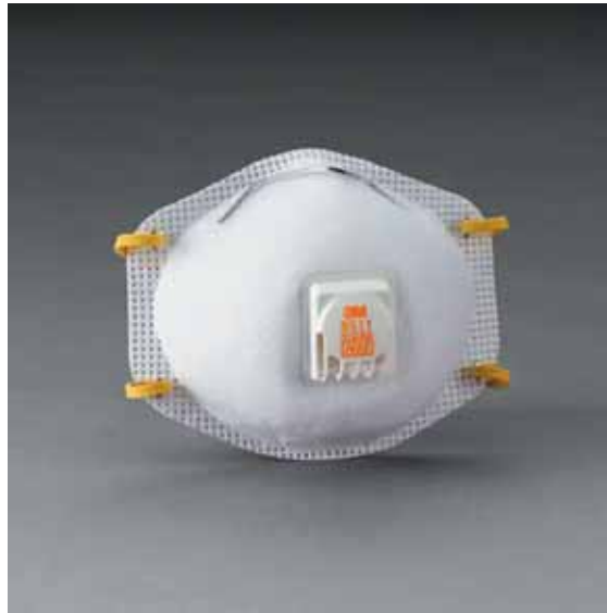
3M 8511 N95 Filtering Face Piece Respirator