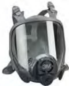
3M Full Face Piece 6000 series