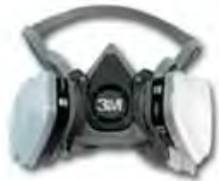
3M Half Face Piece 6000 series With Organic Vapor Cartridges & 5N11 N95 Prefilters