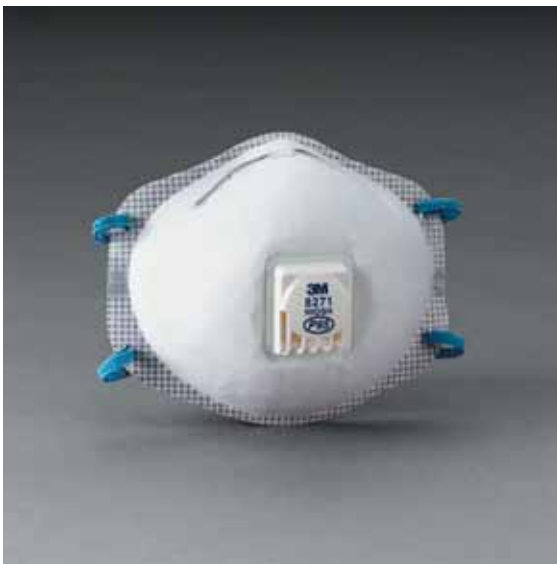
3M 8271 P95 Filtering Face Piece Respirator