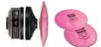
North P100 Pancake filters