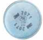
3M 2071 P95 Particulate Filter