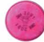
3M 2091 P100 Particulate Filter