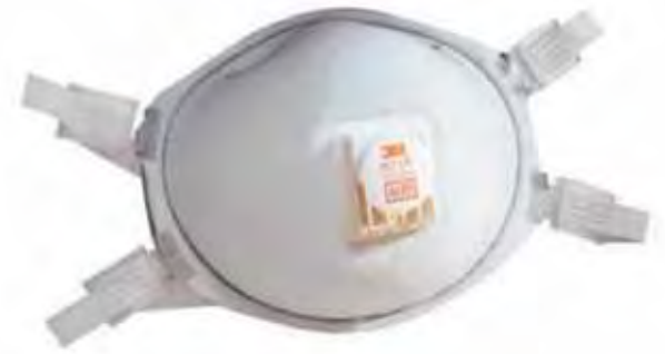
3M 8214 N95 Welding Fumes Respirator