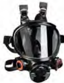
3M 7800 Series Ultimate Reuseable Full Face Piece Respirator