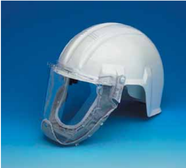
3M 700 Series Helmet Headtops