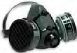
North 5500 Half Mask Economic Respirator w/Organic Vapor Cartridges