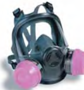
North Safety Small 5400 Economic Full Face Piece