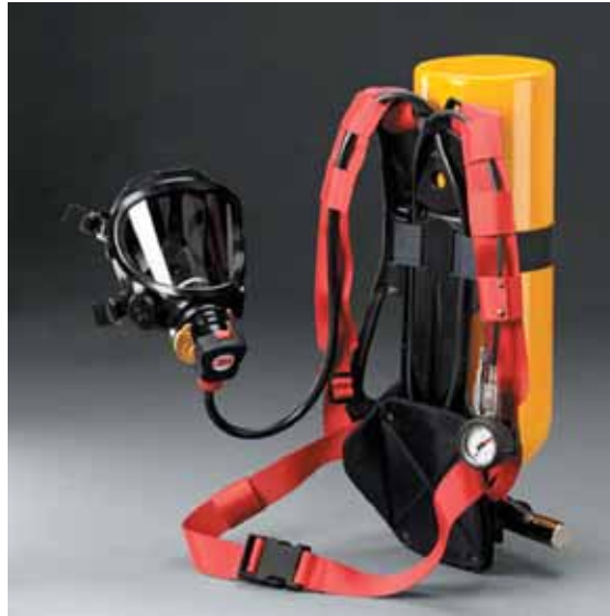
Air-Mate 30 Minute 2000 SCBA