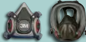
Cartridge Face Piece Use with Cartridges and Particulate Filters