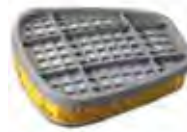
3MR 6003 OV / AG