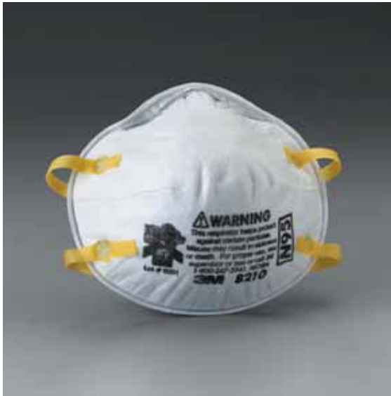
3M 8210 N95 Filtering Face Piece Respirator