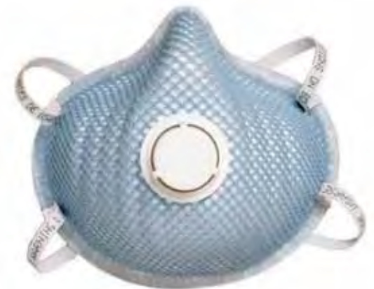
Moldex 2300 N95 Filtering Face Piece Respirator