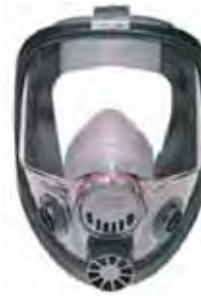
North Safety 7600 Series Silicone Full Face Piece