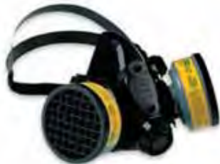
North 7700 Half Face Silicone Respirator