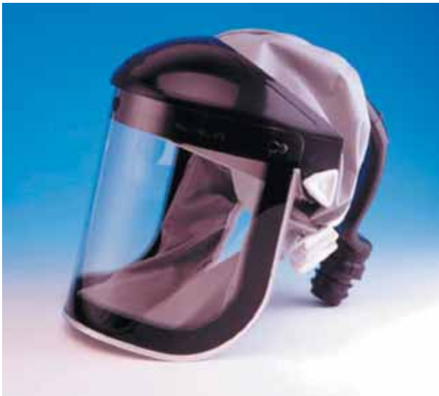
3M 400 Series Visor Headtops